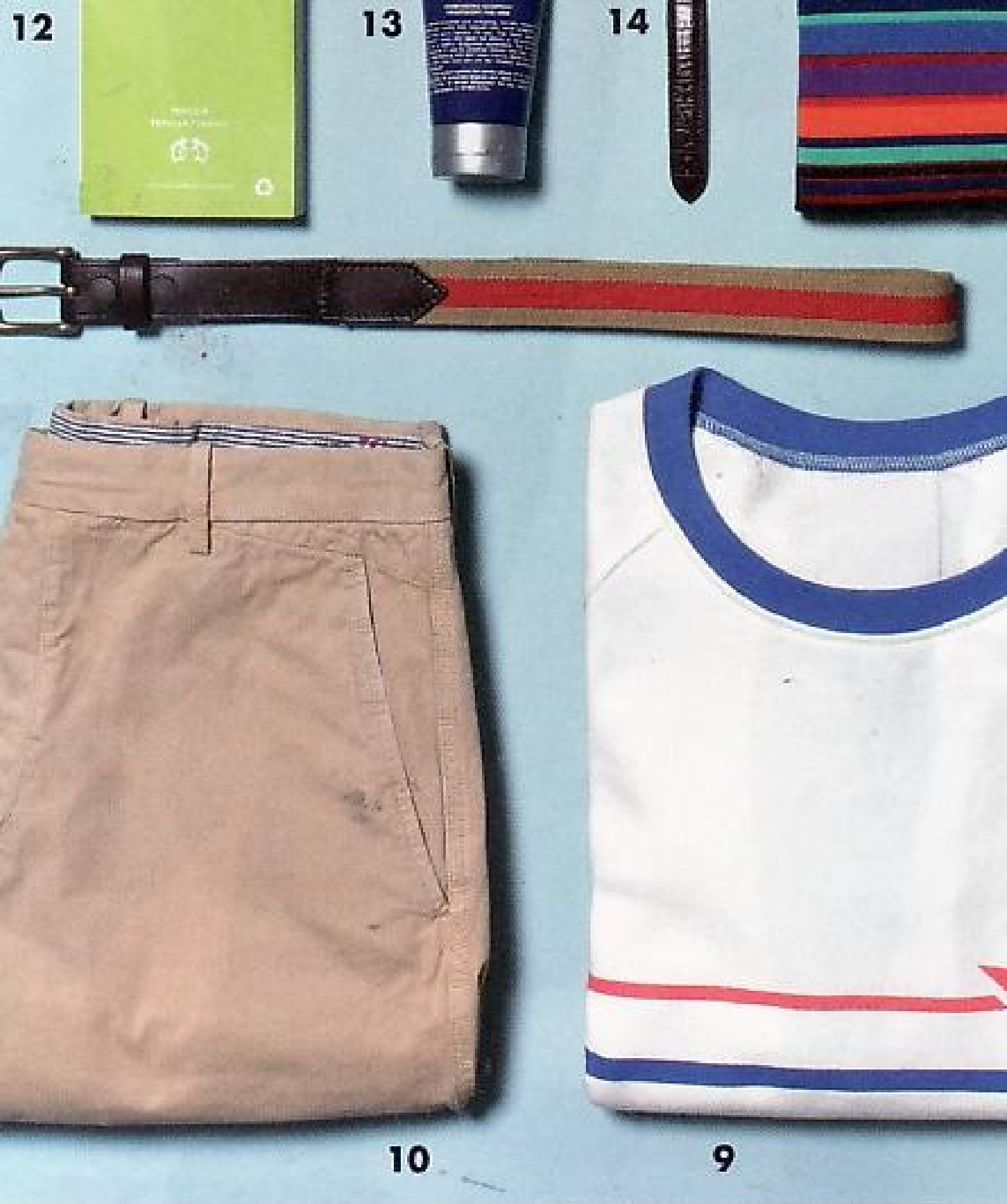
Shoulder bag from River Island, £29.99 2 Hooded jacket by Henri Lloyd, £269 3 Boat shoes by Lyle & Scott, £41 exclusively at Harrods, £41 6 Yellow striped tee by Lyle & Scott, £40 7 Wide-rib sock by Lyle & Scott, £5.3 10 Chinos from Diesel, £140 11 Belt from Chapman, £59 12 Great Expectations by Jil Sander, £565 16 Multi-coloured striped sweater by Jil Sander, available at David Clulow, £565