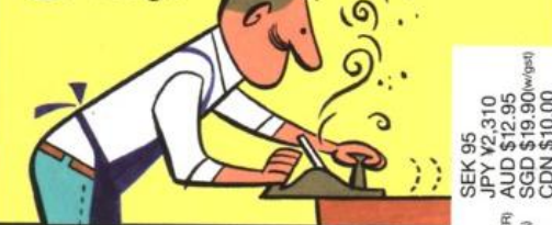
Swede dream design 05