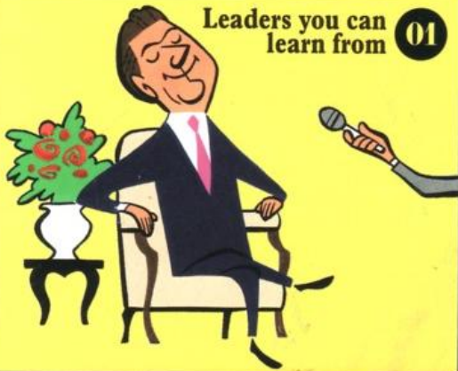
Leaders you can learn from 01