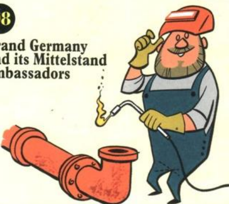
Brand Germany and its Mittelstand ambassadors 08