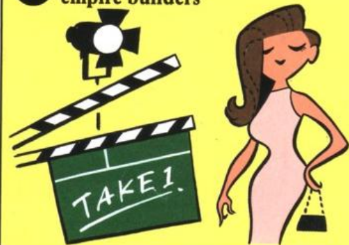
Turkey's soap-show empire builders 03