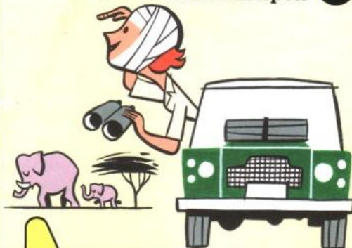
Medical safaris and new health hotspots 02