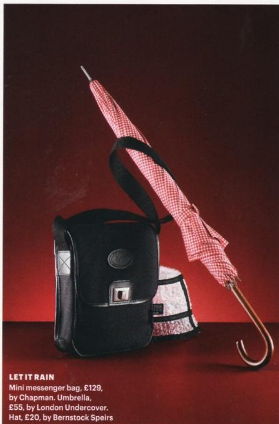
LET IT RAIN Mini messenger bag, £129, by Chapman. Umbrella, £55, by London Undercover. Hat, £20, by Bernstock Speirs

If there's one thing the British know a thing or two about, it's wet weather. Inspired by the old-fashioned rain hats that ladies used to wear in the 1970s, Bernstock Speirs' bubblewrap hat was created to provide a modern answer to an age-old problem. This London-based millinery label strives to create a new generation of hat-wearers, which is not dissimilar to what London Undercover is trying to do in the umbrella world. A rebellion against the signature black canvas, its umbrellas are influenced by quintessentially British things – the greasy spoon café tablecloth version opens up to reveal an image of a full English breakfast. And all umbrellas are made using recycled canvas, metal shaft and frames, and biodegradable handles. Ending our trio of rainwear, bag specialist Chapman has brought out a mini messenger bag. Handcrafted in Cumbria, the bags feature a 100 per cent waterproof material – worsted suiting cloth bonded with a cotton Burgundy lining and a natural latex core – making it a most stylish and durable way to keep personal items safe and dry. www.bernstockspeirs.com ; www.londonundercover.co.uk ; www.chapmanbags.com